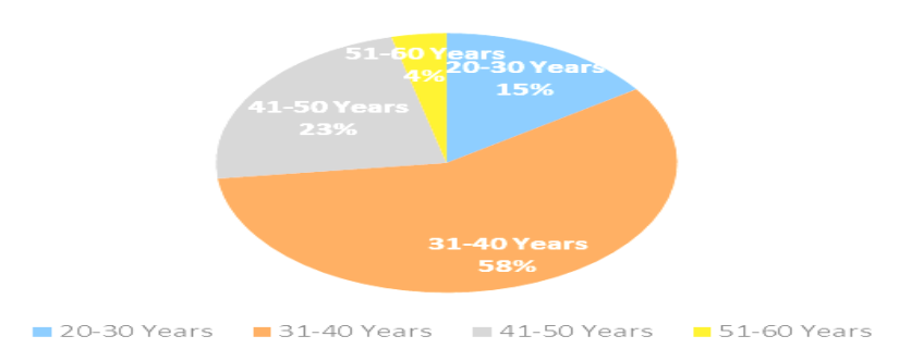
Figure 2. Participants' age