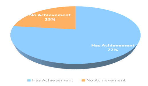
Figure 3. Teachers' achievement

It can be seen in the charts above that the total number of participants who met the criteria was 26 people consisting of 19% men and 81% women. The age of the participants varied with the details 15 % aged 20-30 years, 58 % aged 31-40 years, 23 % aged 41-50 years, and only 4 % aged 51-60 years. Among all participants, only 23% received awards for teacher and student achievements in English competitions (Debating, Speech, etcetera) and teacher's academic achievements.